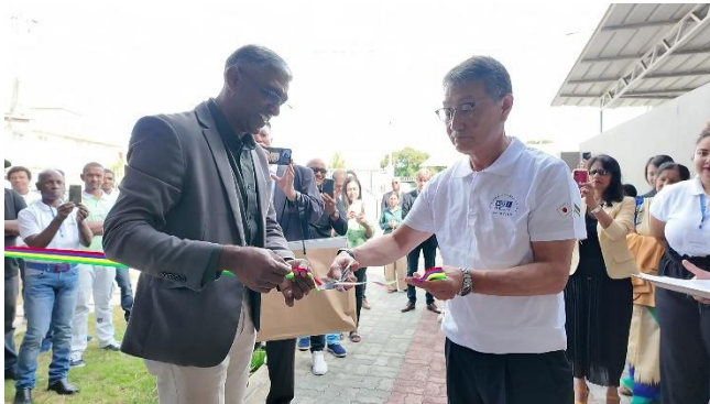
Inauguration by Chairman, MOL Tokyo