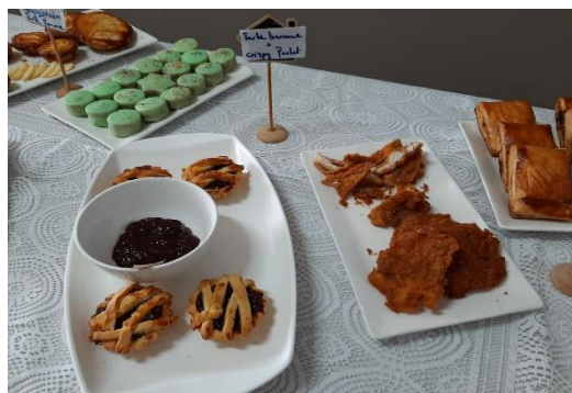
Pastry made by trainees