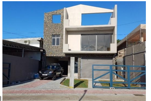
Different phases of construction of ARCH Training Center